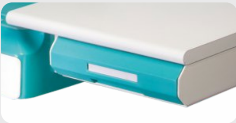
Writing Table With Mini Storage