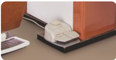
Multifunction footswitch (controls patient chair & phoropter arm)