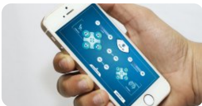
control the unit through "APP"