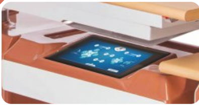
LED touch panel