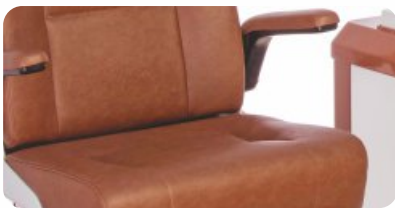
Luxurious leather finish