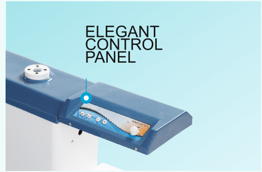
ELEGANT CONTROL PANEL