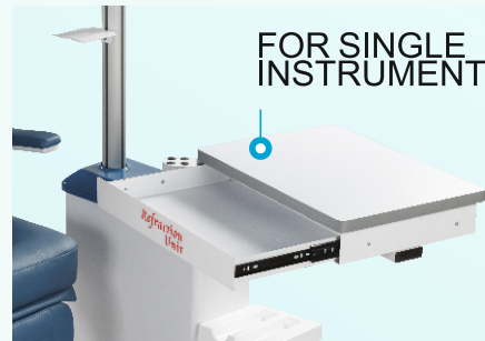
FOR SINGLE INSTRUMENT